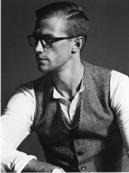
MP by Massimo Piombo

HEIGHT 6' 2" SUIT 40 R SHIRT 15X34 WAIST 34" INSEAM 34" HAIR BLONDE EYES BLUE-GREEN SHOES 12 LOCATION LOCAL